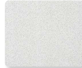
0558 FH White Punto

Ideal for chemical laboratories and other environments requiring a highly resistant and hygienic surface.