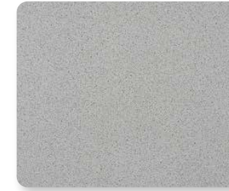
0559 FH Punto Pastel Grey