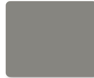
0075 FH Dark Grey